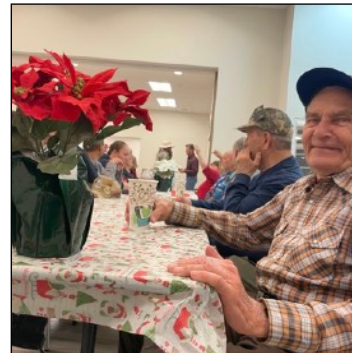
Club Members enjoying the festivities