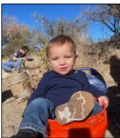
A future Desert Gold Digger!