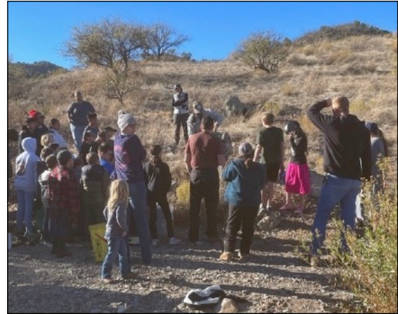
Trail Life USA Scouts and Family Members