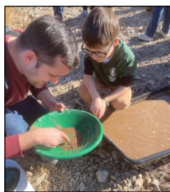
Trail Life Scouts panning concentrates and finding gold