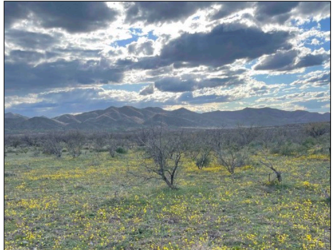
Desert Gold Diggers Campsite