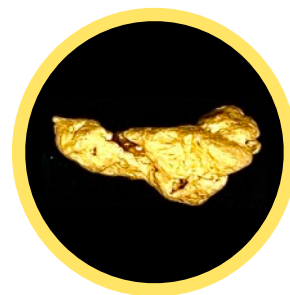
6.1 gram nugget

The raffle tickets are $2.00 each and may be purchased at the membership meetings on the first Tuesday of each month. The lucky winner will be selected at a future 2024 membership meeting.