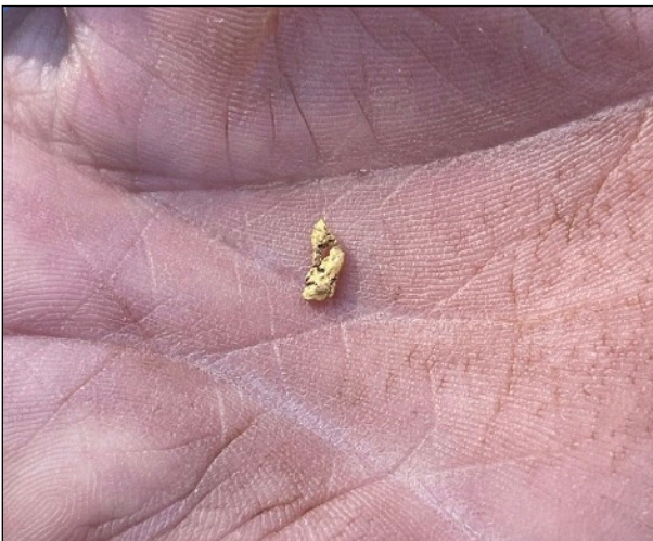
A nice picker