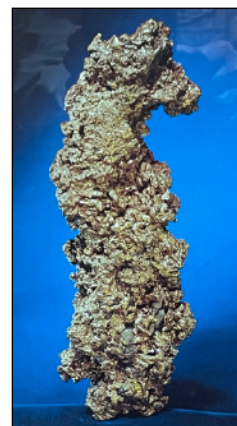
43-ounce Seahorse Nugget

I've metal detected in the Greaterville since the late 1960s. Back then, the area had not been detected heavily and there were days I found more than one gold nugget, with some laying on top of the ground. My favorite gold nugget was a 43-ounce "seahorse" shaped nugget I acquired in California in 1969. Unfortunately, I sold it when gold was only $35 an ounce. The nugget now resides in a museum in south Texas and is valued over 1/2 million dollars! I guess hindsight is 20/20.