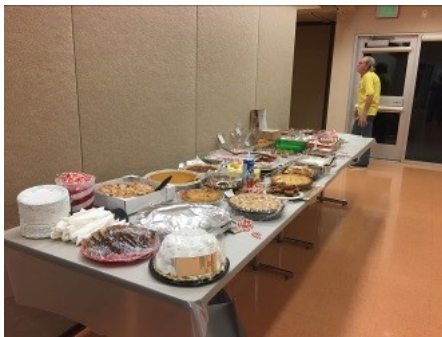
Deserts at the 2018 Christmas Party