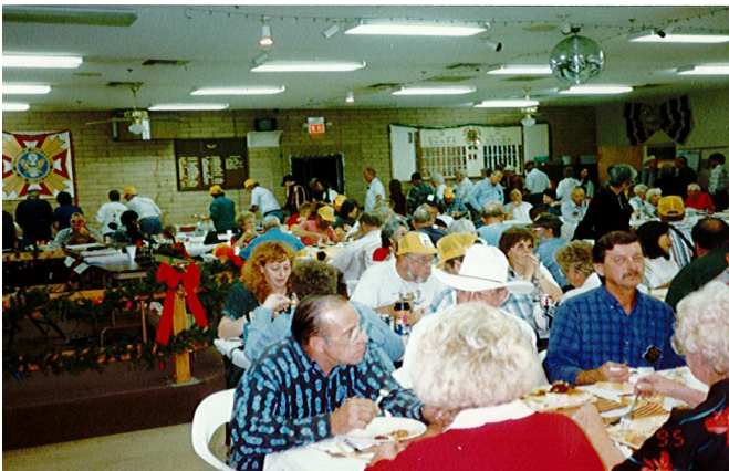
1994 Christmas party at the old VFW

Just a few memories of club activities years ago