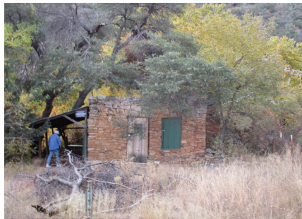
Checking out the old stone cabin near the Hope claims.