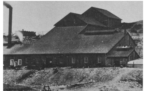
Contention Mill around 1880

In 1882 rails service was extended to Fairbank causing the closing of the railroad depot and the discovery of water closer to Tombstone rendered the mills along the San Pedro obsolete. The Sonoran Earthquake of 1887 dealt its final blow as the Contention Mine was flooded. The post office closed in November 26, 1888 and the town disappeared by 1890. The townsite can be reached by trails maintained by the BLM along the San Pedro River.