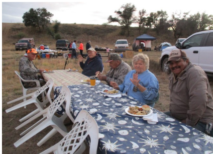
Turkey diner at the November outing

During the depression with the distrust of banks many people felt the need to hide their money, often they passed away before the could recover it. Very often they would pull up a fence post on a corral or prominent fence line and place their valuables in the bottom of the hole. This is called a fence post safe.