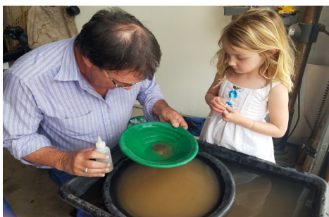
Panning instructions in the garage for spring break visitors from Seattle.

Happy prospecting to everyone and of course may the bottom of your pan turn yellow.