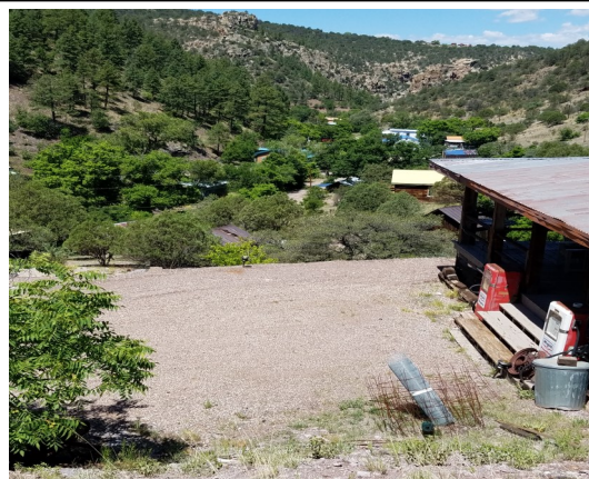
Mogollon, New Mexico