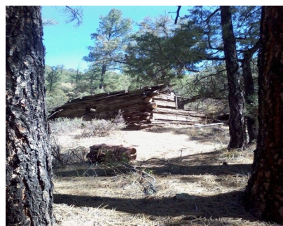
Old Cabin in Bear Creek at the road to Sycamore Canyon near Silver City, NM