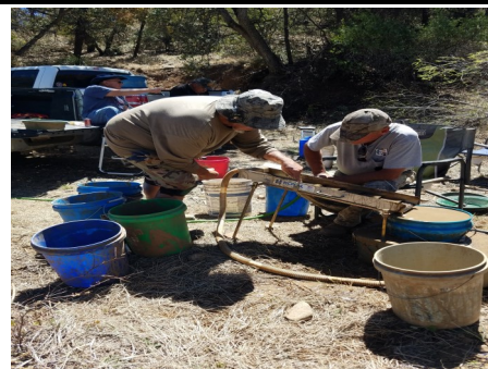
Working the highbanker at Placer Pond