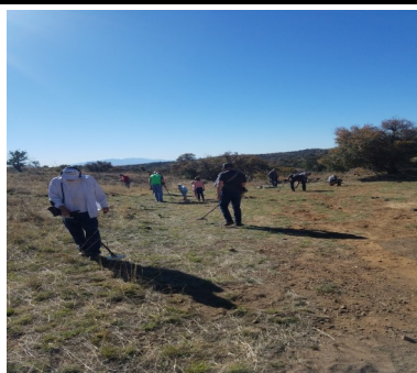
April Outing Nugget Shoot at Placer Pond