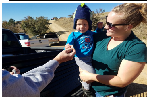
Turning in his find at the April Outing Nugget shoot