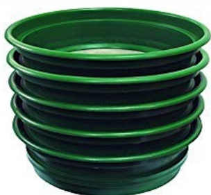
A set of sieves that is available online for about $55

Just like in the stream bed the finer grains of sand and gravel will fall in between the larger grains and all the way to the bottom of the gold pan. Classifying your concentrate before processing in a gold pan or spiral gold wheel prevents the gold particles from being pushed to the top by the smaller particles and washed away while stratifying your material. When the size of the material is roughly consistent, gravity can work as expected, allowing the heavier gold particles to drop the bottom with less encumbrance from small particles. Although more time and labor is required classifying should lead to a greater yield of gold.