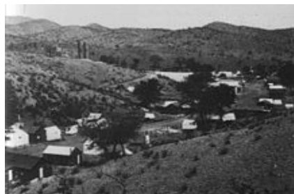
Harshaw in the mid 1880s