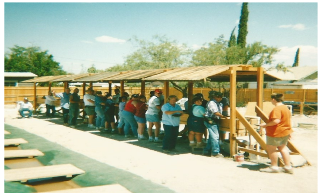
A club outing to Tin Cup Mining in Tombstone