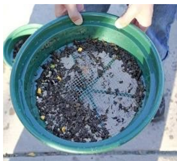
Material classified to about 1/4".

These heavy concentrates present the major problem in the gold recovery process for the average recreational gold prospector and for many commercial miners too. Gold with a specific gravity of 15 to 19.3 and black sand at 5 to 6+, when classified to the same mesh size, will allow the gold contained to be easily recovered. Proper classification (sorting by size) is the key to fine gold recovery from black sands. Without classification, gravel three times the size of gold will be recovered with the gold, hence the necessity for proper classification. Using a set of classifier sieves will help you greatly.