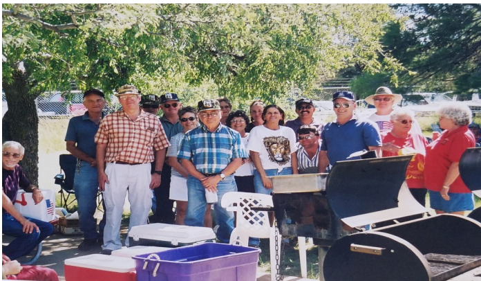
2004 Steak Fry Oracle AZ