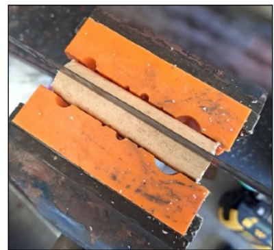
Step 3: Secure & Cut through PVC