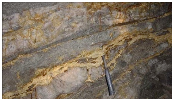
Gold Veins (Lode Gold) Encased in Rock

Lode gold is gold that is found in veins encased in solid rock. Lode gold mining, also referred to as hard rock mining, consists of two main ways to extract gold from the earth: open pit mining (which accounts for over 75% of all hard rock mining) and underground mining which is the most costly of the two mining processes. Hard rock mining is utilized in large mining operations; however, it is these veins of gold encased in rock that are the source of placer gold.