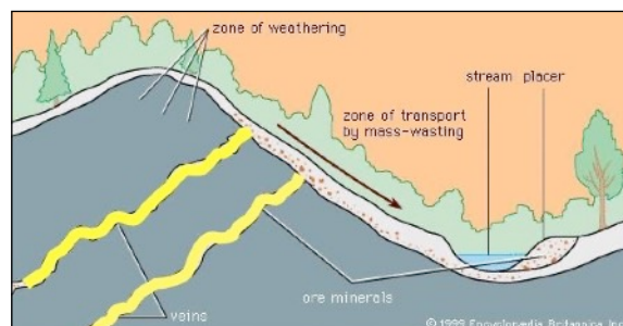
Gold Veins Eroding into Placer Gold

waterways with the heavy gold settling on the bottom of streams, lakes, rivers, or the sea floor. This eroded gold appears in the form of either gold nuggets or gold flakes. As placer gold travels, impurities and corrosive metals such as copper, quartz or silver are eroded away, making it more “pure” or concentrated than lode gold, but never 100% pure.