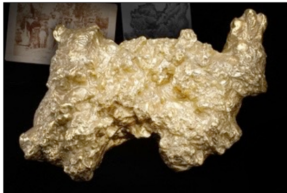
A Replica of the Welcome Stranger Nugget

Goldfields Historical and Arts Society in Dunolly, mentioned the astonishing discovery: "It's significant. It's the largest nugget ever found in the world," he said. "There's not too much of anything that can keep a record for 150 years."