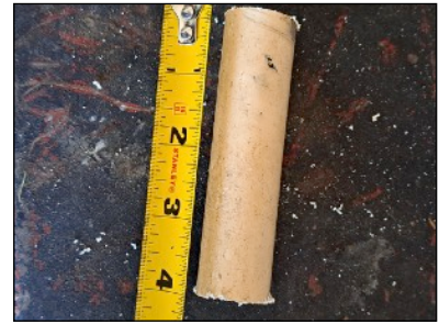
Step 2: Cut a 4" Length of PVC