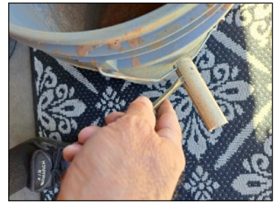
Step 4: Pry Open PVC & Slide Over Wire Handle