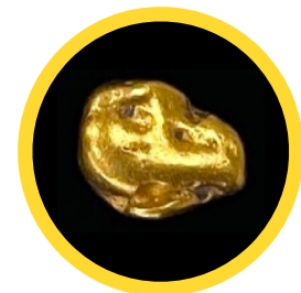
6.16 gram Nugget

The raffle winner will be announced at a future membership in January or February 2025.