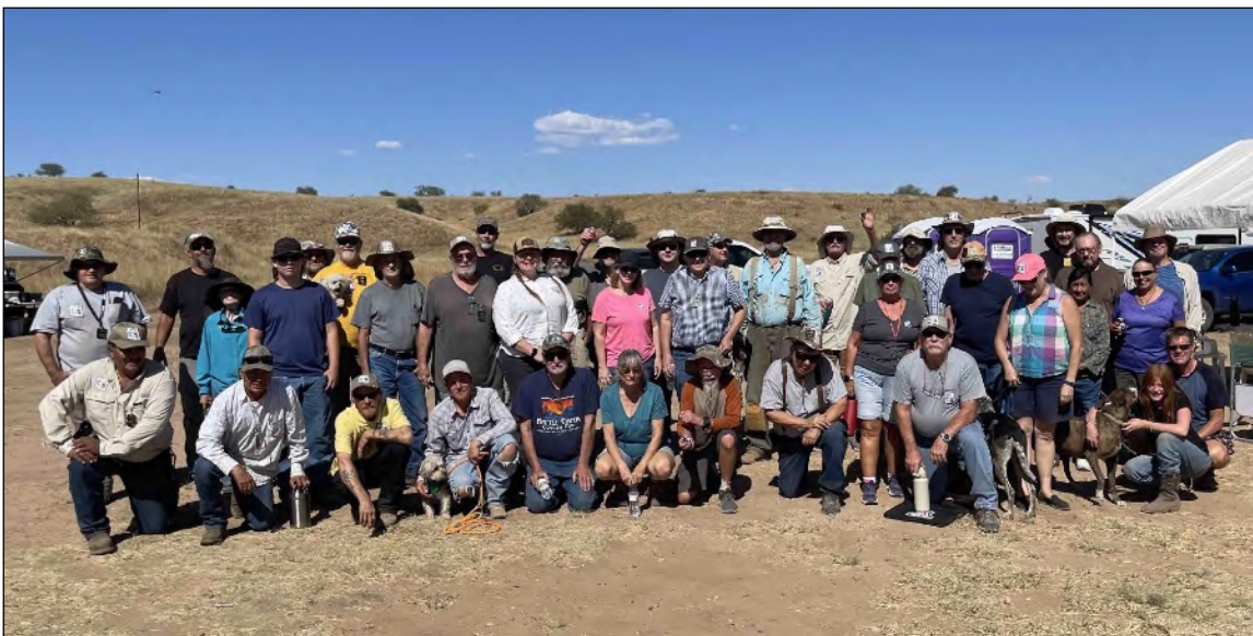
Desert Gold Diggers: 2024 Fall Outing