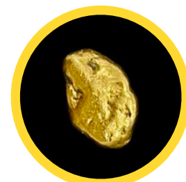
6.78 gram nugget

Raffle tickets are still available for a beautiful 6.78 gram gold nugget! Tickets are $2.00 each and may be purchased from the Goldmaster at the members meetings on the first Tuesday of each month. The raffle winner will be announced at the February members meeting.