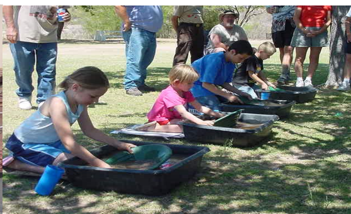
Kids Panning contest April 30 2006