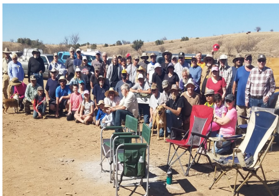
Some of the group of 70 who attended the outing