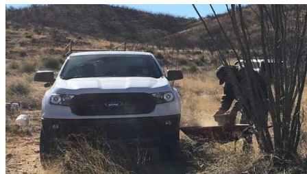
Classifying material and the Pilgrim's Pride claim at the March outing.