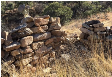
Photo of a rock wall to a shelter or corral on the Pilgrim's Pride claim. This claim has lots of historic ruins