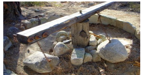
Example of an Arrastra used for grinding ore and processing with mercury. The grinding stones were dragged by donkeys and mules.