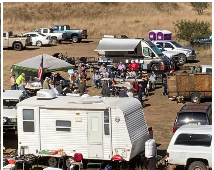
View from the hill above the campsite at November's overnight outing.