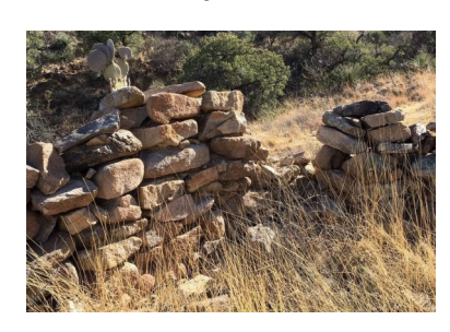
Photo of a rock wall to a shelter or corral on the Pilgrim's Pride claim. This claim has lots of historic ruins