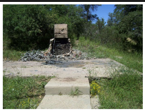
A few photos from Campo Bonito area just north of the Bruiser Claims. Buffalo Bill Cody had great influence in the area as well as the town of Oracle, look up more to find his interesting history in the area. The area is considerably cooler in the summer and can lead to some pleasant outings.