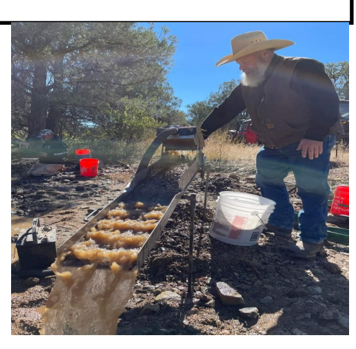
DGD GAZETTE February, March 2023

Using a modified highbanker with the sluice extended to reduce the chance to loose gold >