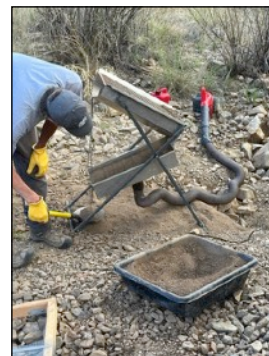
Doug Hayden using a dry washer on the Hope Claim

Ralph Montaño’s Mountain Goat reverse helix trommel was also very impressive and utilizes the same principle as the trommels used by large mining companies. Concentrates added to the hopper are washed and the material flows down into the reverse helix barrel. Once inside the barrel, the material is continuously washed by a full length spray bar to keep it in a slurry. This allows the lighter material to wash out the back into the waste bucket while the heavier material stays in the grooves of the reverse helix screw and works its way up to the front and is collected in a gold catch cup. This is another tool that is very efficient and a great alternative to panning, and like the gold wheel, requires a constant supply of water to work properly.