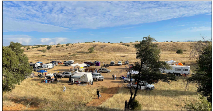
Gardner Canyon Campsite

The Desert Gold Diggers enjoyed an overnight outing that was a complete success. The weather was beautiful and 57 members participated in the outing. Thank you to everyone that contributed their time and effort in helping load, deliver, setup equipment and supplies, prepare food, and provide the needed support to make this such an enjoyable event.