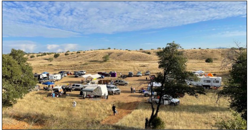
The Gardner Canyon Campsite