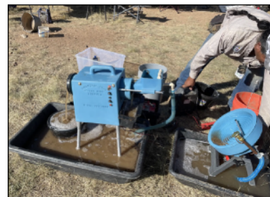
Ralph Montano's Mountain Goat reverse helix trommel