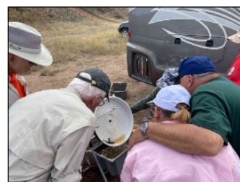
Gold climbing up the spirals in the Gold Wheel