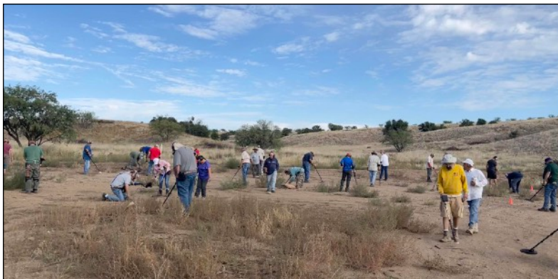
Metal Detector Hunt